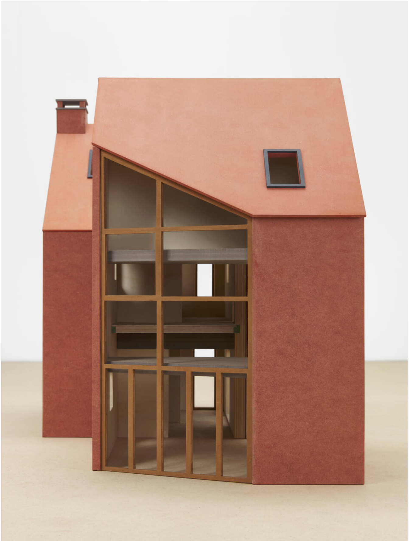
Tim Rogge Architectuur Studio, Broek, 2020