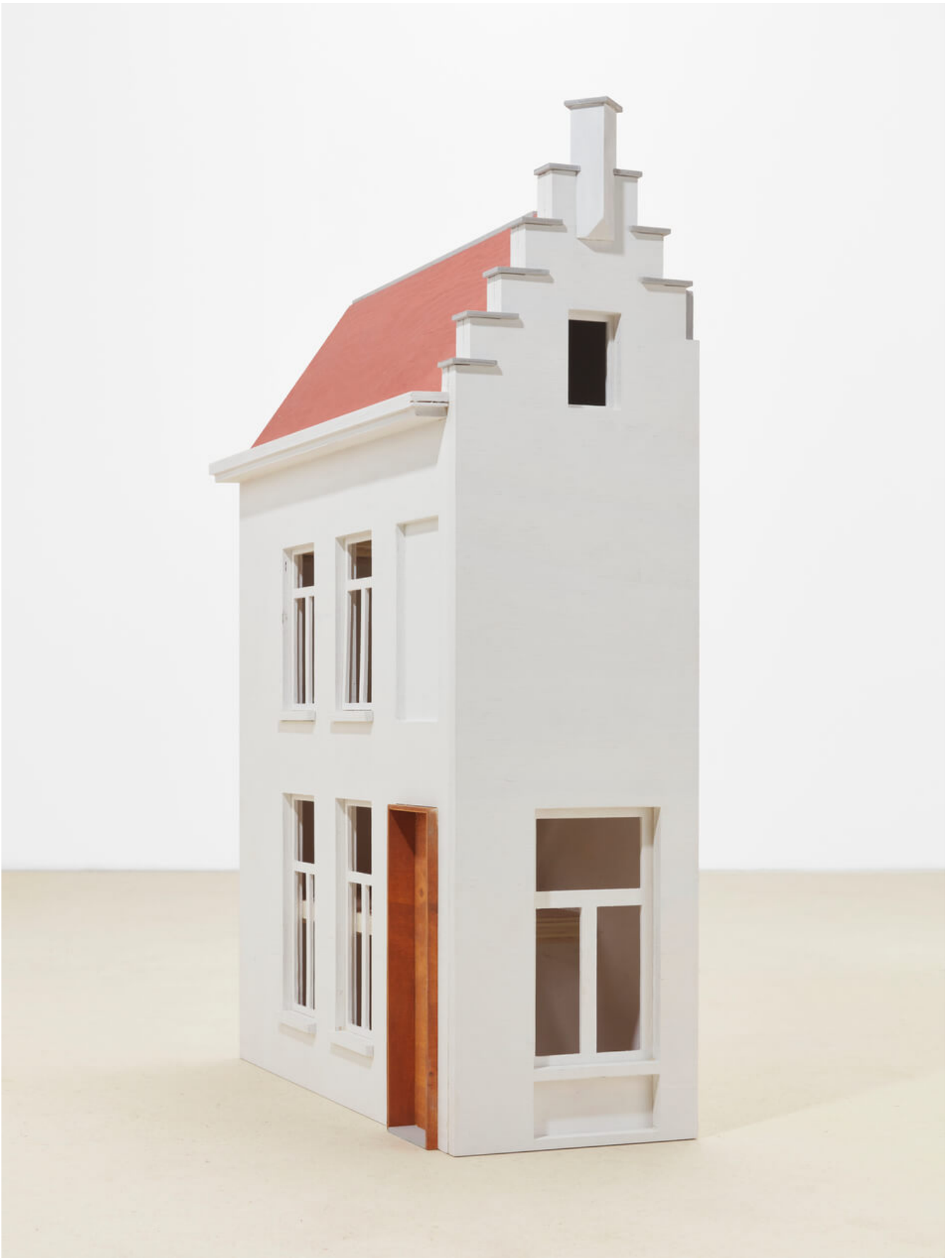
dmvA, One Room Hotel, 2015