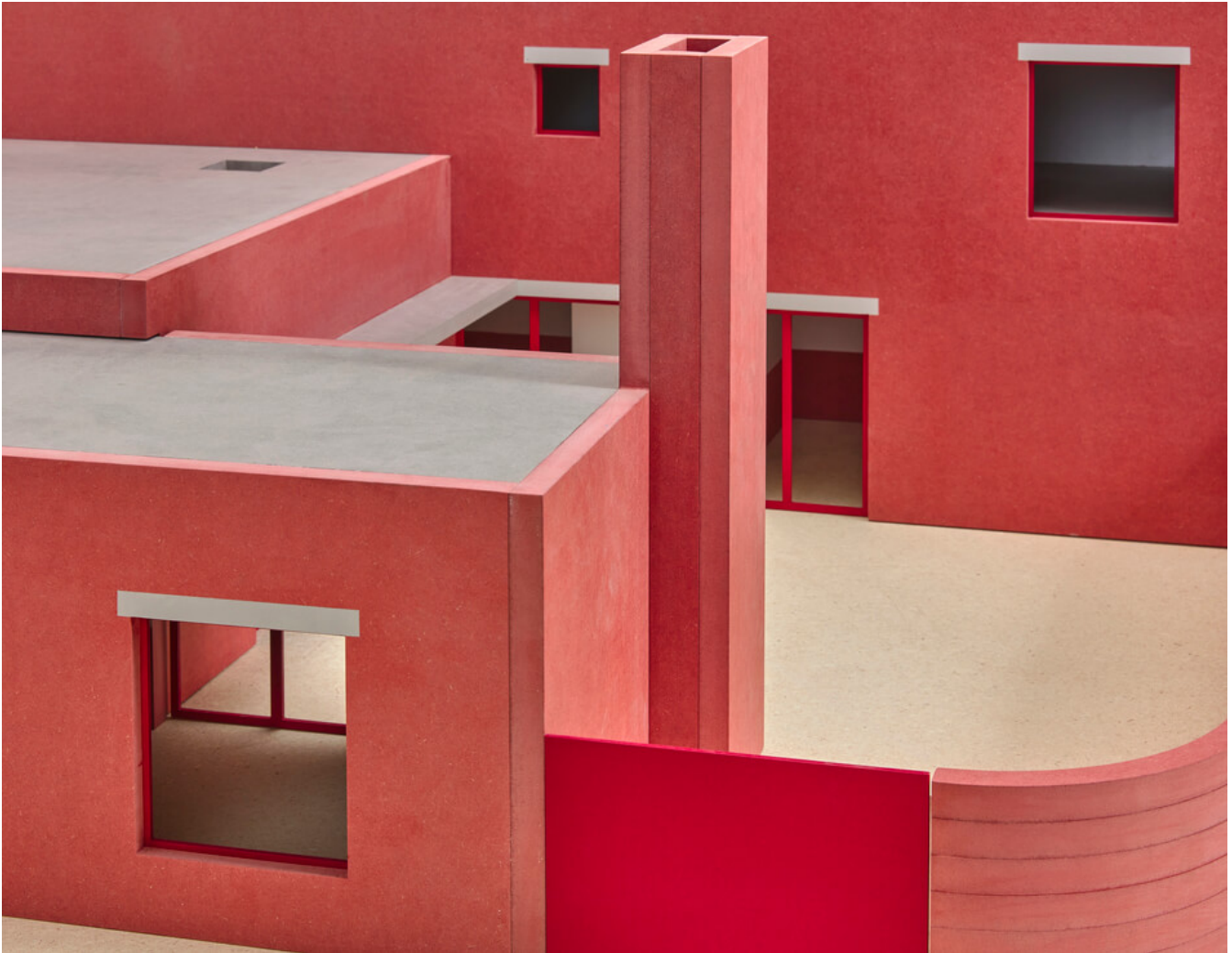
RAAMWERK, Youthcenter 'De Lichting', 2018

This summer, Venice will host the Biennale Architettura 2021 , the world's most important exhibition in the field of contemporary architecture. On the initiative of the Flemish Community and commissioned by the Flanders Architecture Institute (VAi), Bovenbouw Architectuur will present the exhibition Composite Presence in the Belgian pavilion . By means of 50 reference projects, curator Dirk Somers (Bovenbouw Architectuur) will show the contemporary city in Flanders and Brussels in all its complexity: 'Composite Presence embodies the love-hate relationship between architecture and city .'