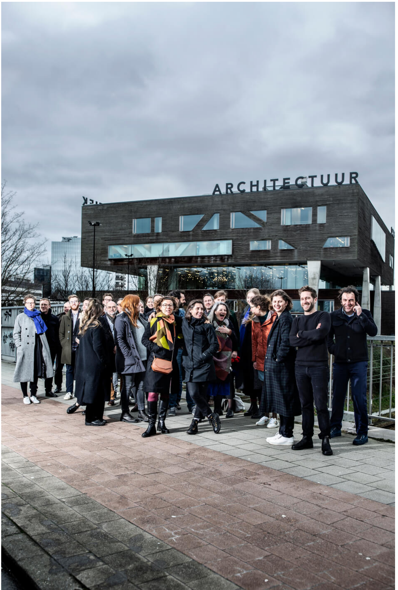
Flanders Architecture Institute © Franky Verdickt