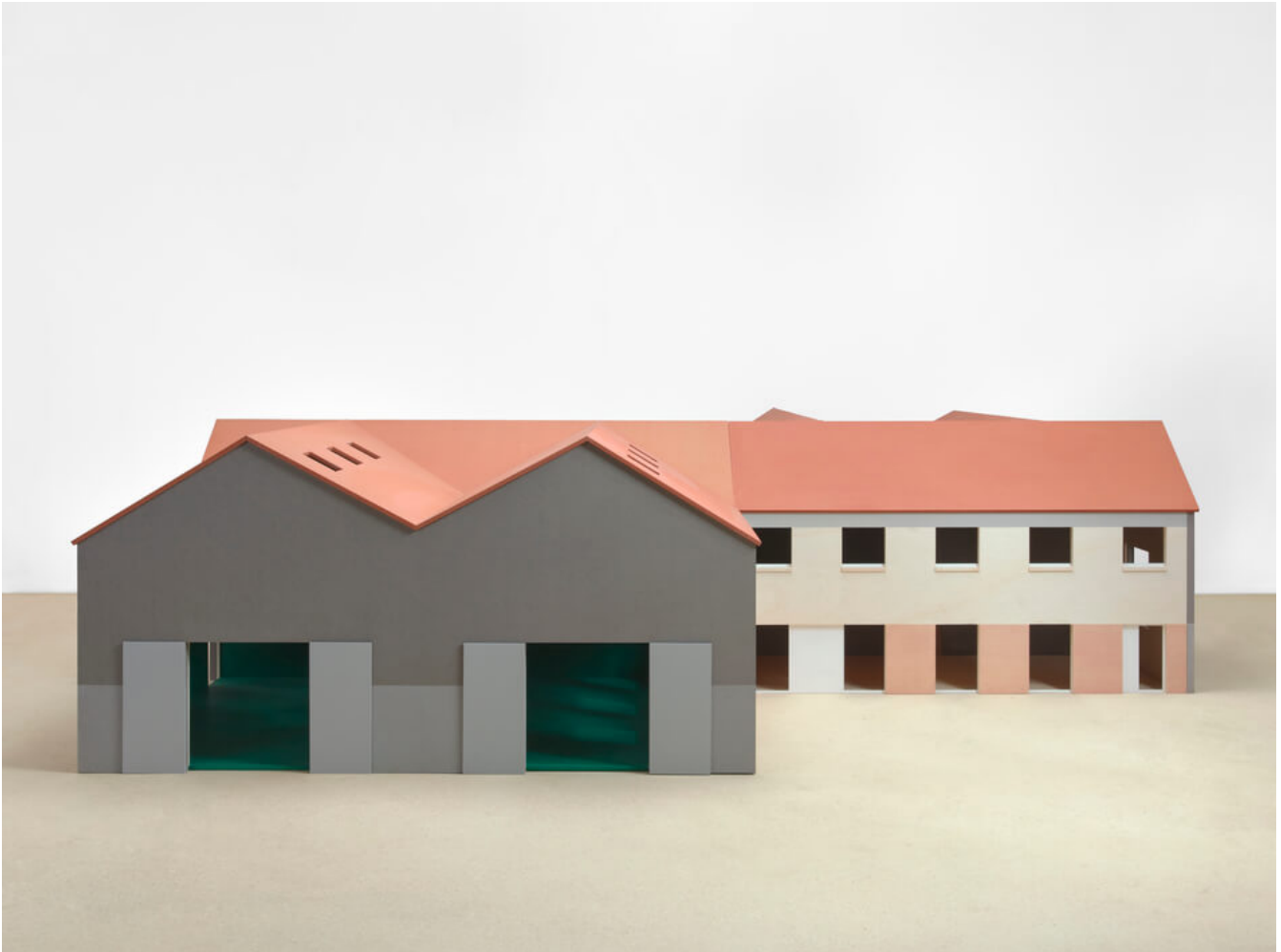
FELT architecture & design, Elementary School Zarren, 2018