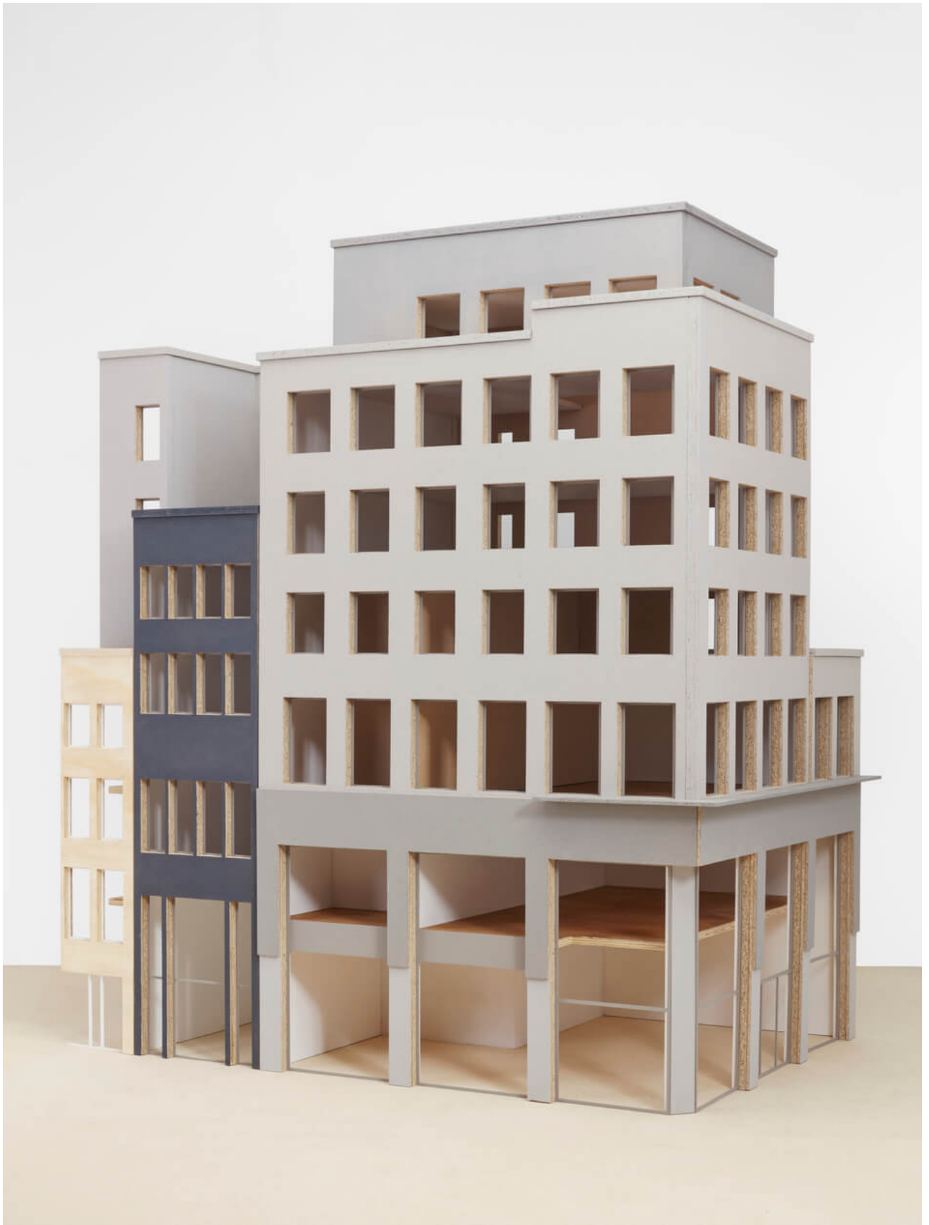
DMT architecten, Meir corner building, 2006 © We Document Art