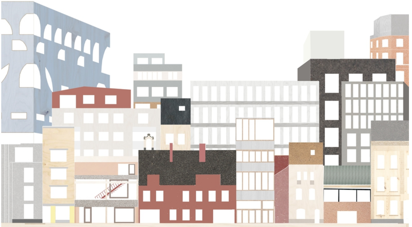
Composite Presence - campaign image © Bovenbouw Architectuur