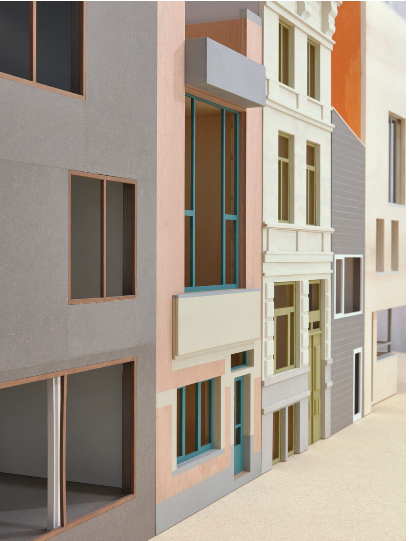
Composite Presence, Bovenbouw Architectuur, 2020