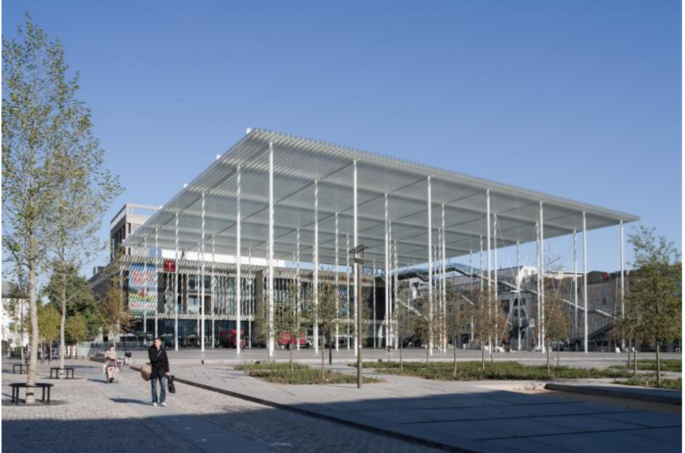
Redesign of the Theaterplein in Antwerp by Studio Associato Bernardo Secchi Paola Viganò in collaboration with Dirk Jaspaert/BAS

Driessche, opened in 2019 in Ghent and traveled to Brussels, Hasselt, and Kortrijk, before its last stop in Antwerp. The main section is "Wunderkammer," which looks at "seventeen public buildings under the microscope," including the Redevelopment of the Theaterplein and surroundings in Antwerp by Studio Associato Secchi-Viganò (below, also on the cover of Celebrating Public Architecture ). The curators use photographs to document the buildings but also models that pull away the "building faces" to "isolate a different aspect of the appearance of the buildings."