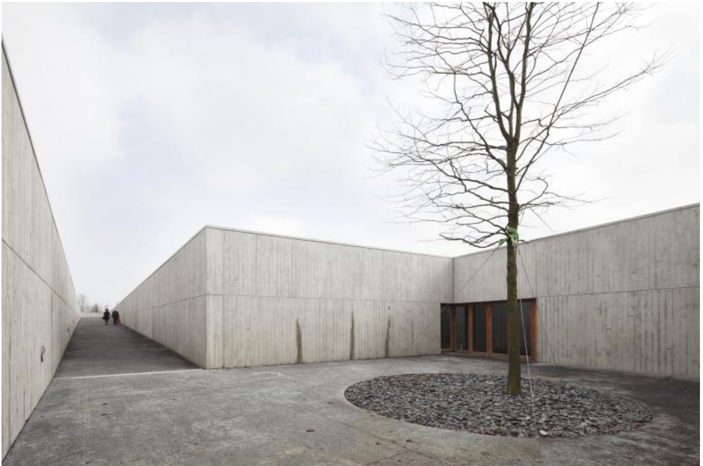
Uitzicht Crematorium in Kortrijk by Eduardo Souto de Moura and SumProject