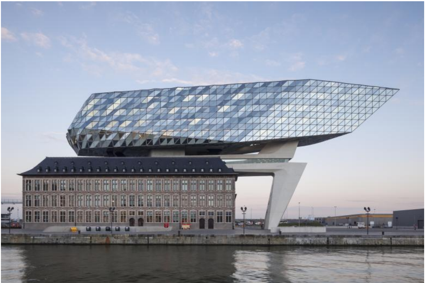
Port Authority Headquarters in Antwerp by Zaha Hadid Architects

Two books and two exhibitions celebrate two decades of the Flemish government in Belgium commissioning architects for building projects through the Open Call, a unique "more-than-a-competition" process that has resulted in more than 300 completed buildings, landscapes, and infrastructural projects to date. Most importantly, the program is responsible for a marked improvement in the quality of public architecture in Flanders this century.