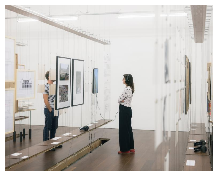
Installation view of As Found at De Singel (September 6, 2023 - March 17, 2024)

World-Architects has not (yet) seen the exhibition in person, so this review focuses on the companion publication, As Found: Experiments in Preservation , edited by the exhibition's curators: Sofie De Caigny, Hülya Ertas, and Bie Plevoets. Nonetheless, photographs of the exhibition in the expo hall at De Singel express a scenographic synergy with the exhibition's theme of working with existing building: FELT architecture & design took such "as found" elements as the suspended ceiling panels and wood floor boards to structure the aisles for the exhibition and suspend the photographs, drawings, headphones, and other components.