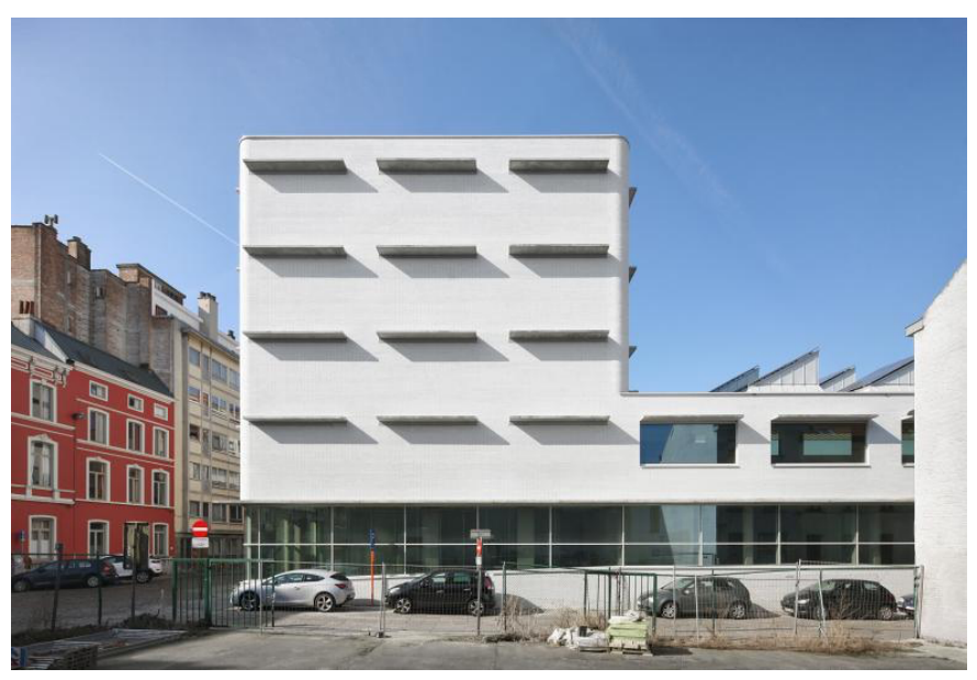
State Archives in Ghent by Robbrecht en Daem Architecten, 2010–2014

With just seven Flemish projects, each one documented across a dozen pages, the value of As Found is not as a sourcebook of case studies: it is in the seven experimental architectural positions that can be used by architects to determine how they respond to existing conditions. A project need not have a heritage component for new buildings or interventions to find inspiration; like the Smithsons, the "ordinary, prosaic things" in cities and other contexts can be sources of creativity.