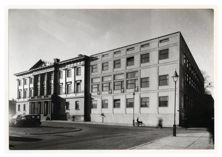
Gothenburg City Hall Extension by Gunnar Asplund, 1936

While the case studies in As Found are not as broad as the examples in Experimental Preservation , the approaches to preservation, conservation, heritage, and other aspects of dealing with existing buildings in the book are nevertheless diverse. For example, the <u>Open Air Storage of the Antwerp Public Art Collection</u> finds Brussels architect Ash Çiçek experimenting with reconfiguration : reusing concrete pedestals on the site of Middelheim Museum in which "new configurations were formed, creating fresh relations between the sculptures themselves and between the sculptures and viewers," as described by Bie Plevoets.