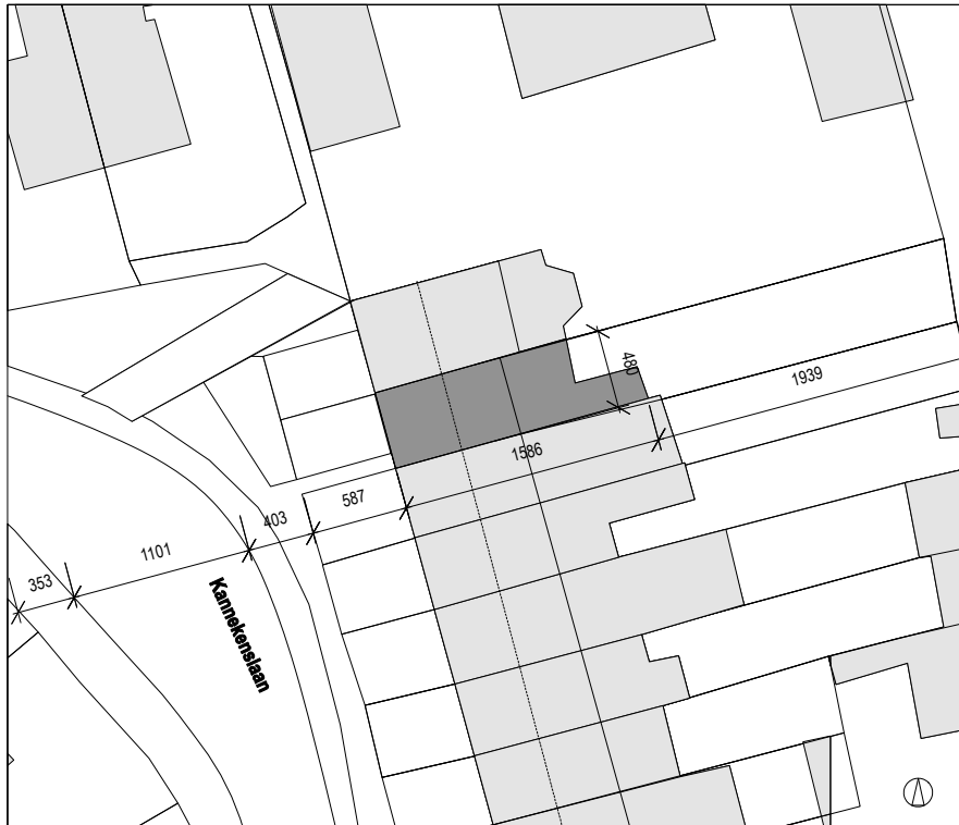
INPLANTINGSPLAN BESTAAND S 1/500