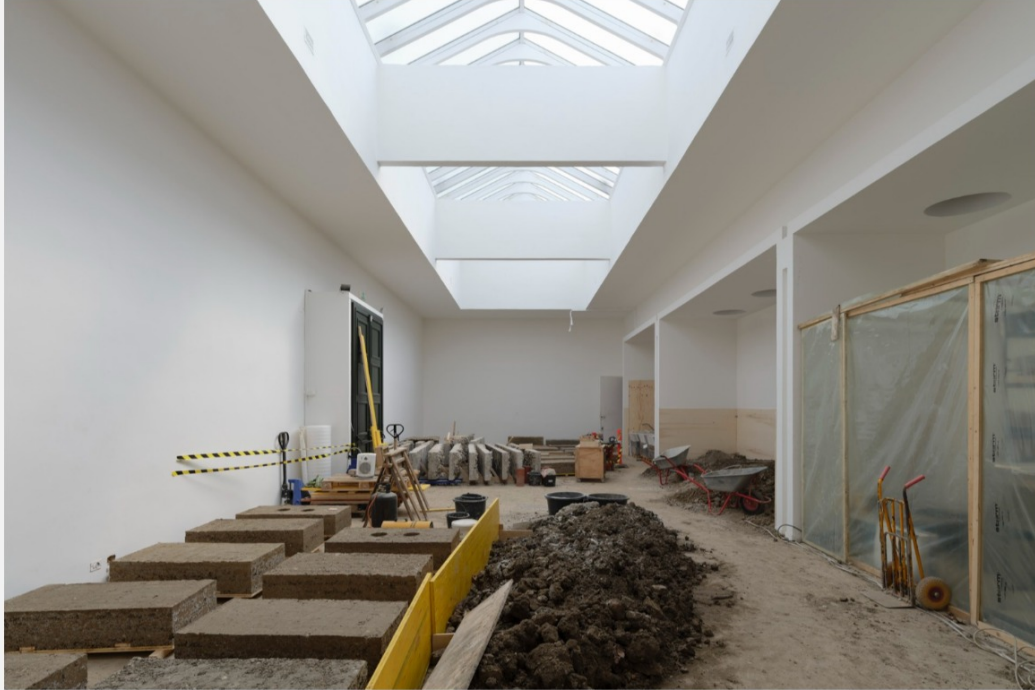
One Biennale pavilion is presented as an open construction site: "Build of Site" is the title of the Danish architect Søren Pihlmann's contribution.

Bringing even more landscape into the world of architecture, the Belgian Pavilion at the Biennale features a contribution by Bas Smets and Stefano Mancuso which explores how buildings can develop into dynamic biospheres. "Building Biospheres" brings a unique prototype to Venice. This prototype tests how plants can actively shape and control the indoor climate of a building. The behaviour of the plants is precisely monitored, and the resulting data is used to control the building's irrigation, lighting and ventilation systems. Bas Smets and Stefano Mancuso envisage "an architecture as a microclimate in which plants and people can coexist".