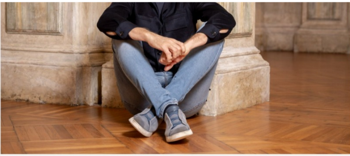
Carlo Ratti is the curator of the 19th Venice Architecture Biennale.