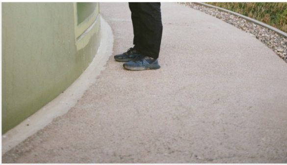
Sonic Investigations, Luxemburg Pavillon, © Courtesy of Valentin Bansac, 2024