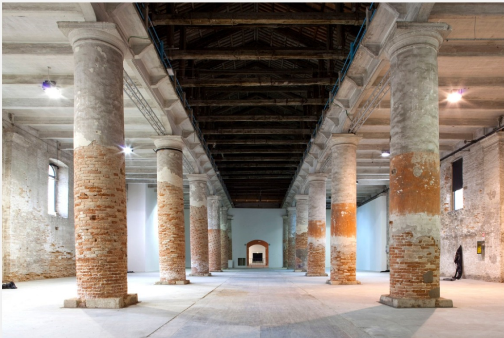
The 19th edition of the Architecture Biennale will take place in Venice from May 10 to November 23, 2025.

research artificial intelligence green city building in existing structures architecture biennale