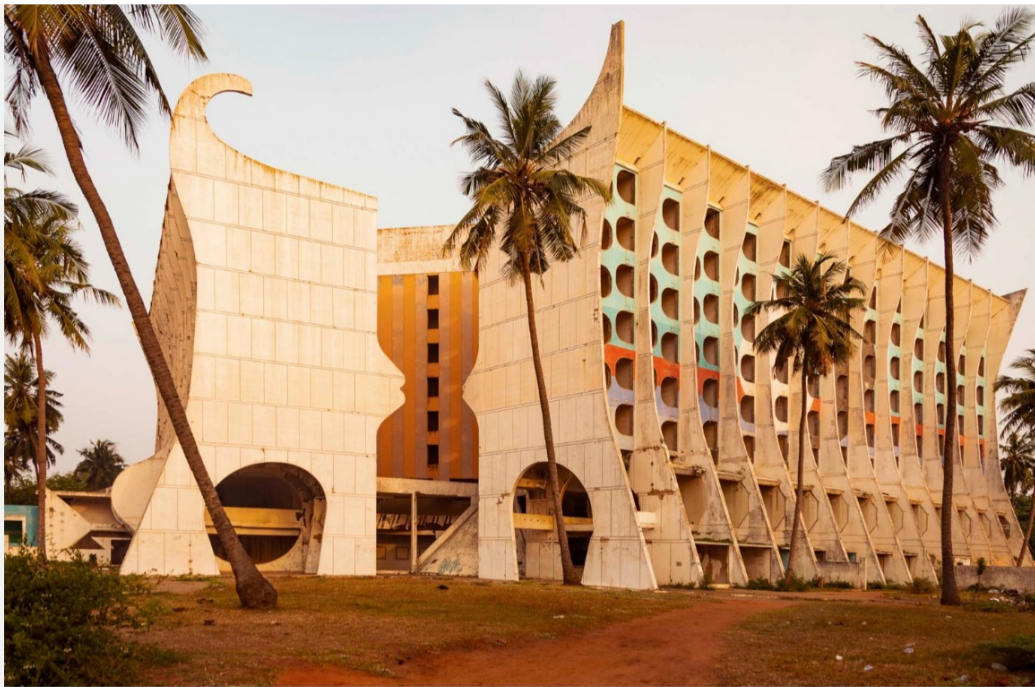
The national pavilion of the West African Republic of Togo presents "Considering Togo's Architectural Heritage". The photo shows the Hotel de la Paix.