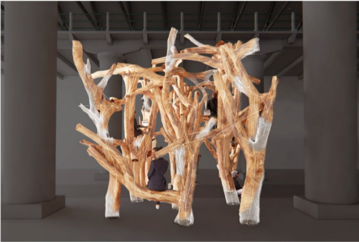
Living Structure.