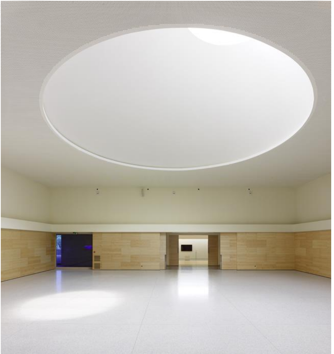
Crematorium Daelhof, Zemst (BE), Christian Kieckens Architects & DAE, 2011-2015